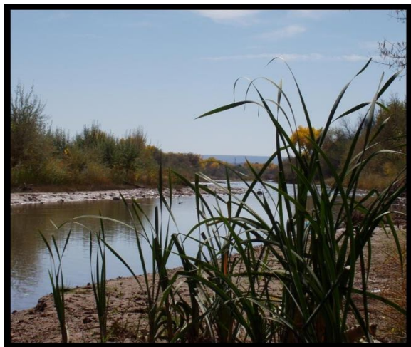
Río Grande at Española

Given that the Management Plan for Northern Rio Grande National Heritage Area does not propose the construction of new facilities such as parking lots or visitor centers, and given that the focus of the Management Plan is on interpretation of the region’s history, its importance and environment, there will be no impacts to stream flows or associated wetlands. Therefore, no consultation with the U.S. Army Corps of Engineers is planned.