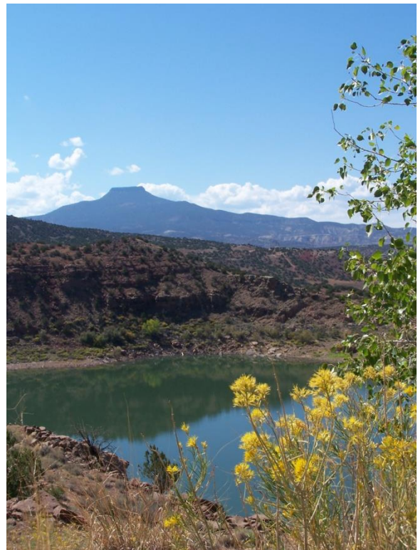
Pedernal and Abiquiu Lake

13. At Santa Cruz Lake , the Rio del Medio and Rio Frijoles are impounded behind Santa Cruz Dam, built in 1929 by the Santa Cruz Irrigation District, which regulates water releases for agricultural use in the Santa Cruz Valley. The Bureau of Land Management manages the recreation area, which comprises rugged, rolling foothills, characterized by mesas and steep canyons.