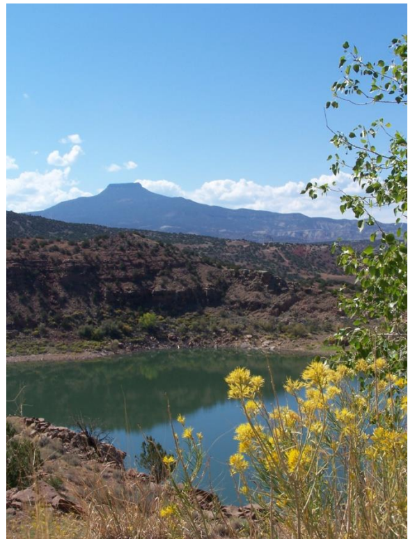
Pedernal and Abiquiu Lake

13. At Santa Cruz Lake , the Rio del Medio and Rio Frijoles are impounded behind Santa Cruz Dam, built in 1929 by the Santa Cruz Irrigation District, which regulates water releases for agricultural use in the Santa Cruz Valley. The Bureau of Land Management manages the recreation area, which comprises rugged, rolling foothills, characterized by mesas and steep canyons.